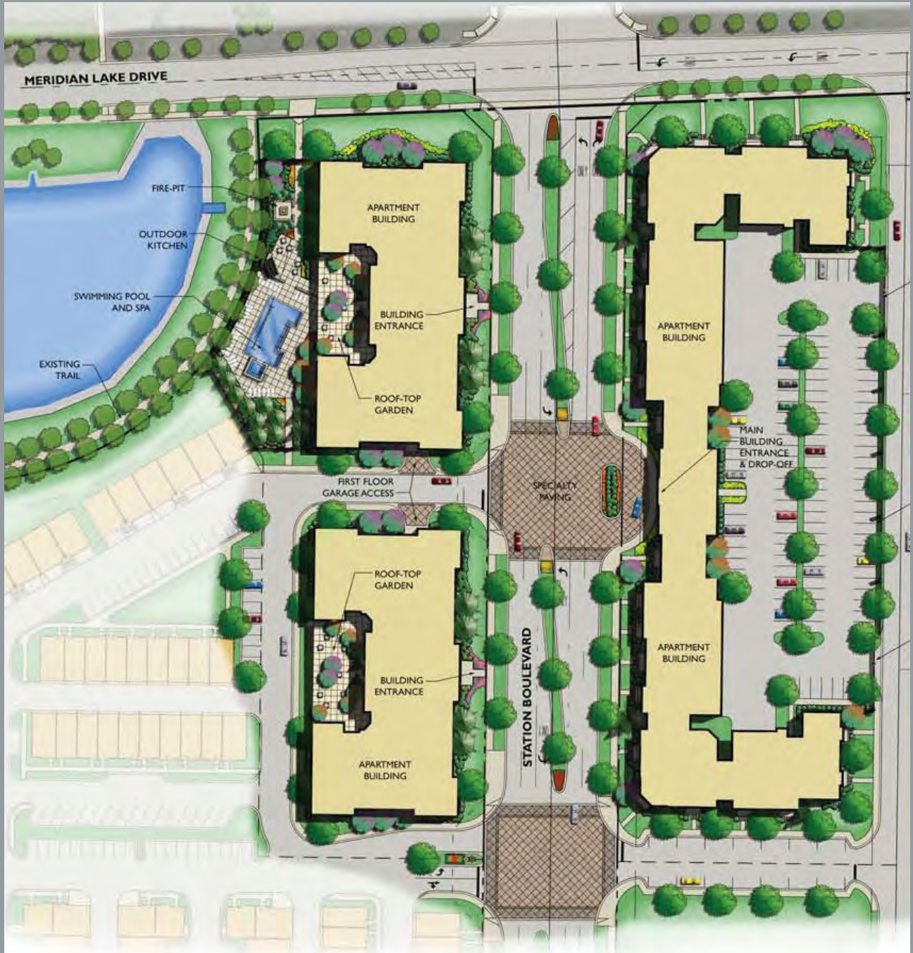
North Parcel - Lofts at Kensington Station Concept Plan

24.8± total acres preliminarily planned for 429 residential units · Aurora · DuPage County, Illinois